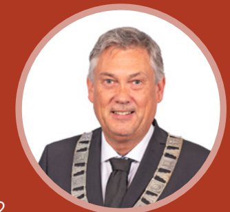
Petter Sortland Mayor

HØYANGER INDUSTRIAL PARK IS AN IDEAL LOCATION FOR DEVELOPING NEW SUSTAINABLE PROCESS MANUFACTURING SOLUTIONS